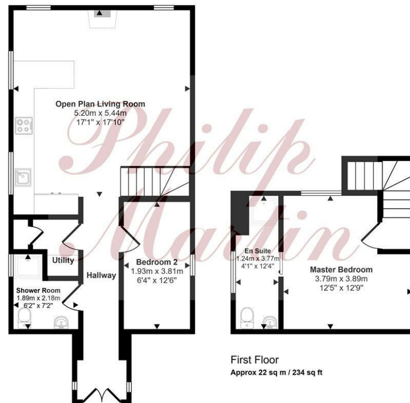
First Floor Approx 22 sq m / 234 sq ft

Approx Gross Internal Area 73 sq m / 787 sq ft